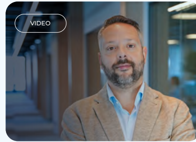
Organisational transformation with Atlassian